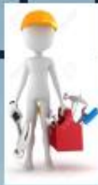
Diverse City – Game Board