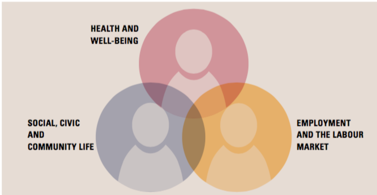
Figure 0.1 The overlapping benefits of ALE