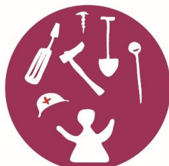
LABOUR MARKET & EMPLOYMENT