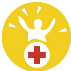
HEALTH & WELL-BEING