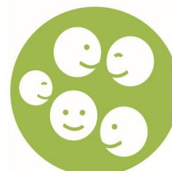
SOCIAL, CIVIC & COMMUNITY LIFE